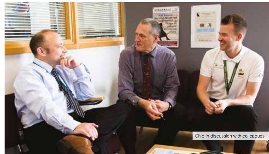
Chip in discussion with colleagues

"The role is very ad-hoc. People may come in to see me or I might have meetings about funding for certain projects, then I might speak to a matron about capturing veterans' information. There isn't a set pattern because it can change every 10 minutes, let alone every day."