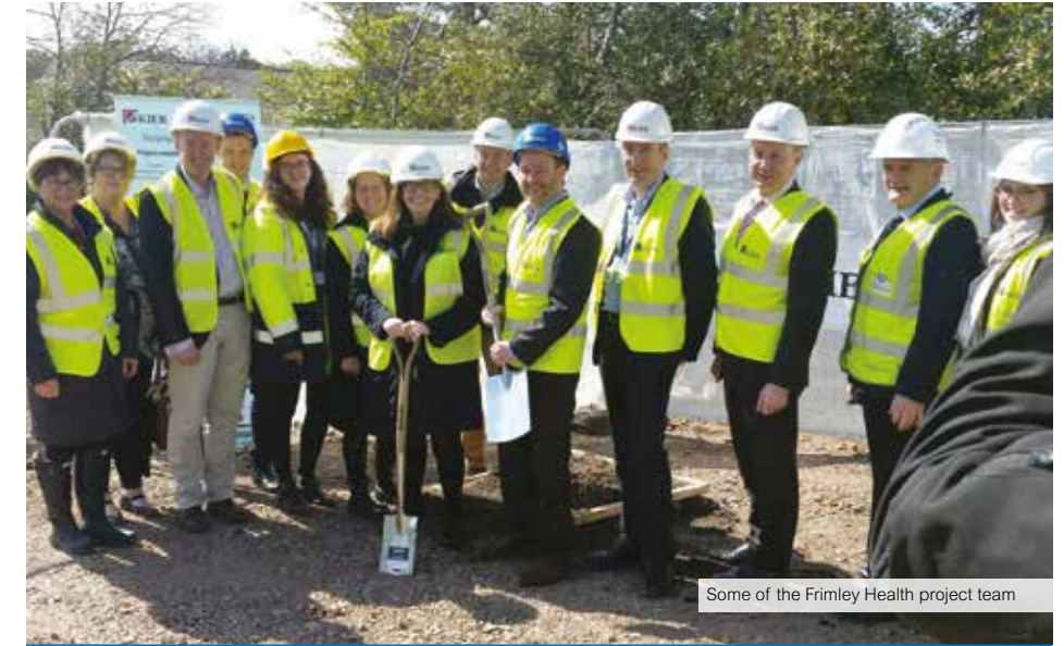
Some of the Frimley Health project team

The main building frame will be up quickly and there is another year or so of external and internal construction before fitting out starts.