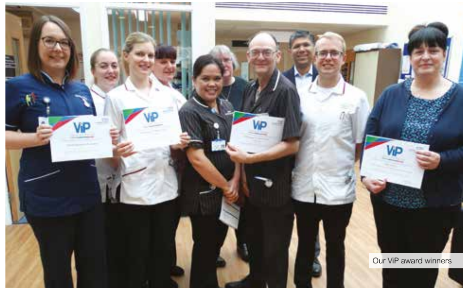
Our ViP award winners